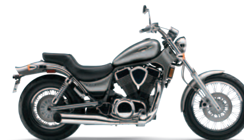
Metallic Oort Gray (YHG)

Specifications, appearances, equipments, colors, materials and other items of "SUZUKI" products shown on this catalogue are subject to change by manufacturers at any time without notice and they may vary depending on local conditions or requirements. Some models are not available in some territories. Each model might be discontinued without notice. Please inquire at your local dealer for details of any such changes. Actual body color might differ from the colors in this catalogue.