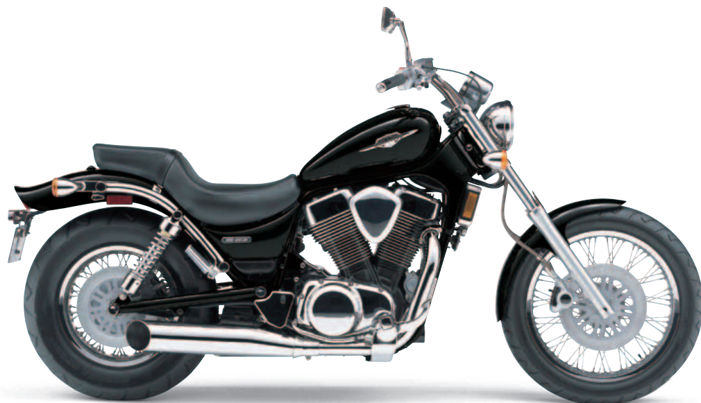
Pearl Nebular Black (YAY)