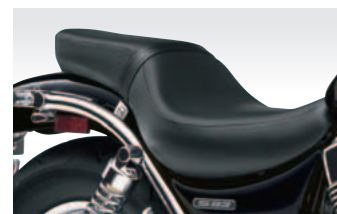
Sleek, wide seat